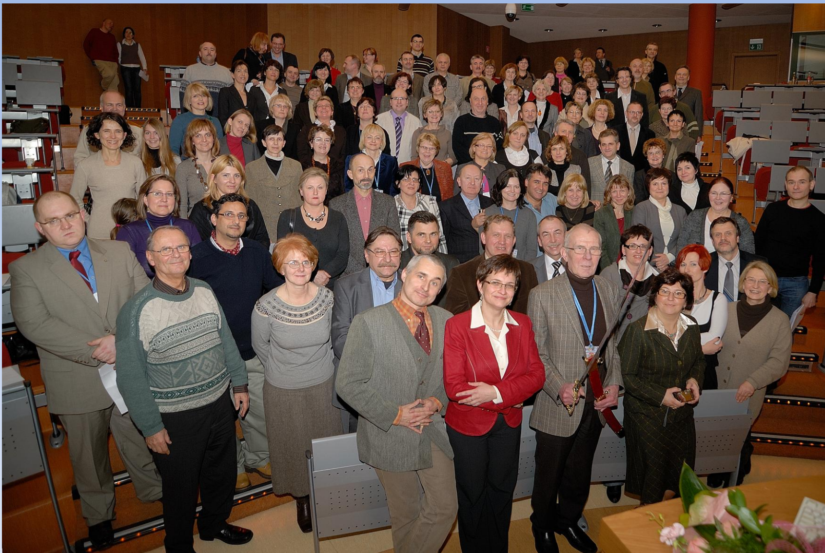
Our students (2007 – 2009)